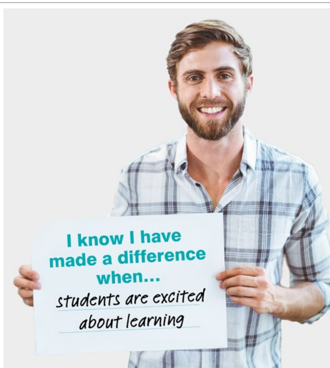
It's National Certified Teacher Month—let's celebrate the impact of great teachers #myteachimpact

These are simply our ideas, so go ahead and get creative in coming up with ones that work for you.