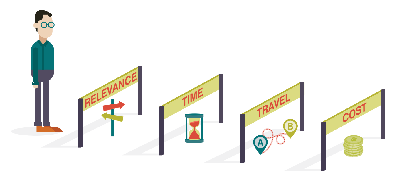
Figure 3 Barriers for casual teachers to engage in high-quality PL.