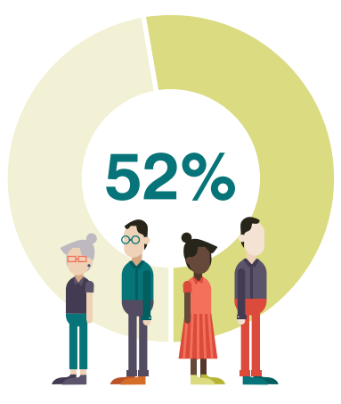
had undertaken fewer than 16 hours of PL in the prior 12 months