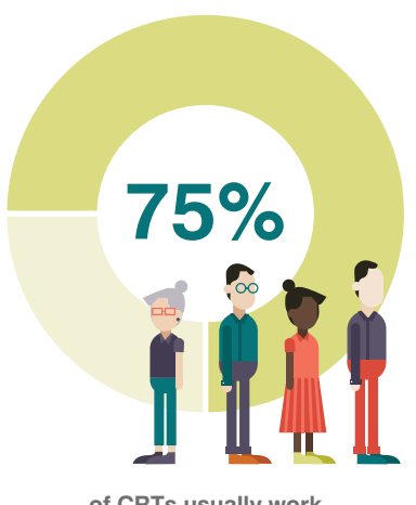
of CRTs usually work at the same school on a regular basis