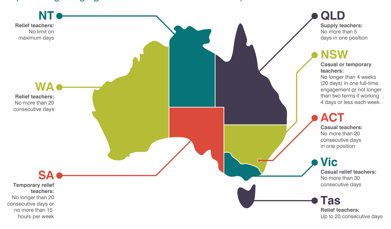
Figure 2 Titles and maximum terms for relief teachers across Australia (Sources: State and Territory Enterprise Bargaining Agreements and education websites)

The roles, titles and the maximum number of days that CRTs can work in one position varies across Australia (Figure 2). Teachers who work casually usually take on one of two roles: filling in for an absent teacher for a specific number of days or weeks; or taking on longer periods of contract work without becoming a permanent employee. The majority (84%) of the survey respondents usually worked on a day-by-day basis with the remainder usually undertaking short-term contracts of a week or more.