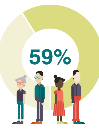
were never invited to undertake PL within their workplaces