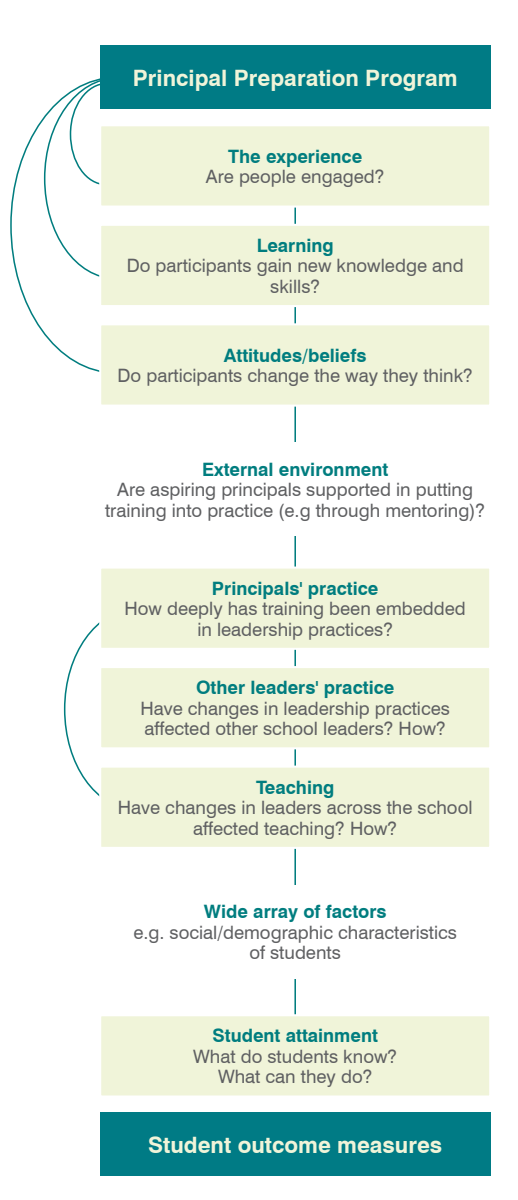
Figure 3: Likely linkage from principal preparation to student outcomes (simplified)

In the absence of strong information on outcomes, all those with a stake in principal preparation face challenges in deciding where to invest their resources. Individual aspirants have difficulty selecting the programs most likely to help them progress, systems and sectors face difficult decisions about which programs to support, and professional learning providers do not have the information needed to improve the impact of their programs.